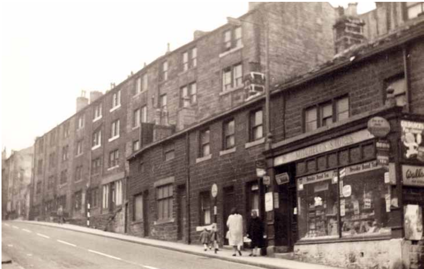
The north side of Bridge Lanes.