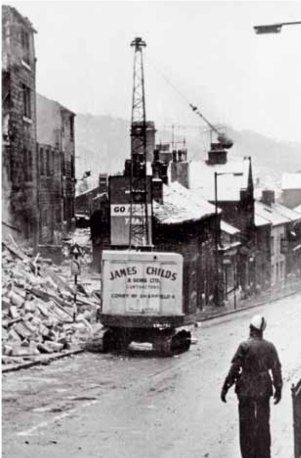
Demolition of Croft Place, 1963