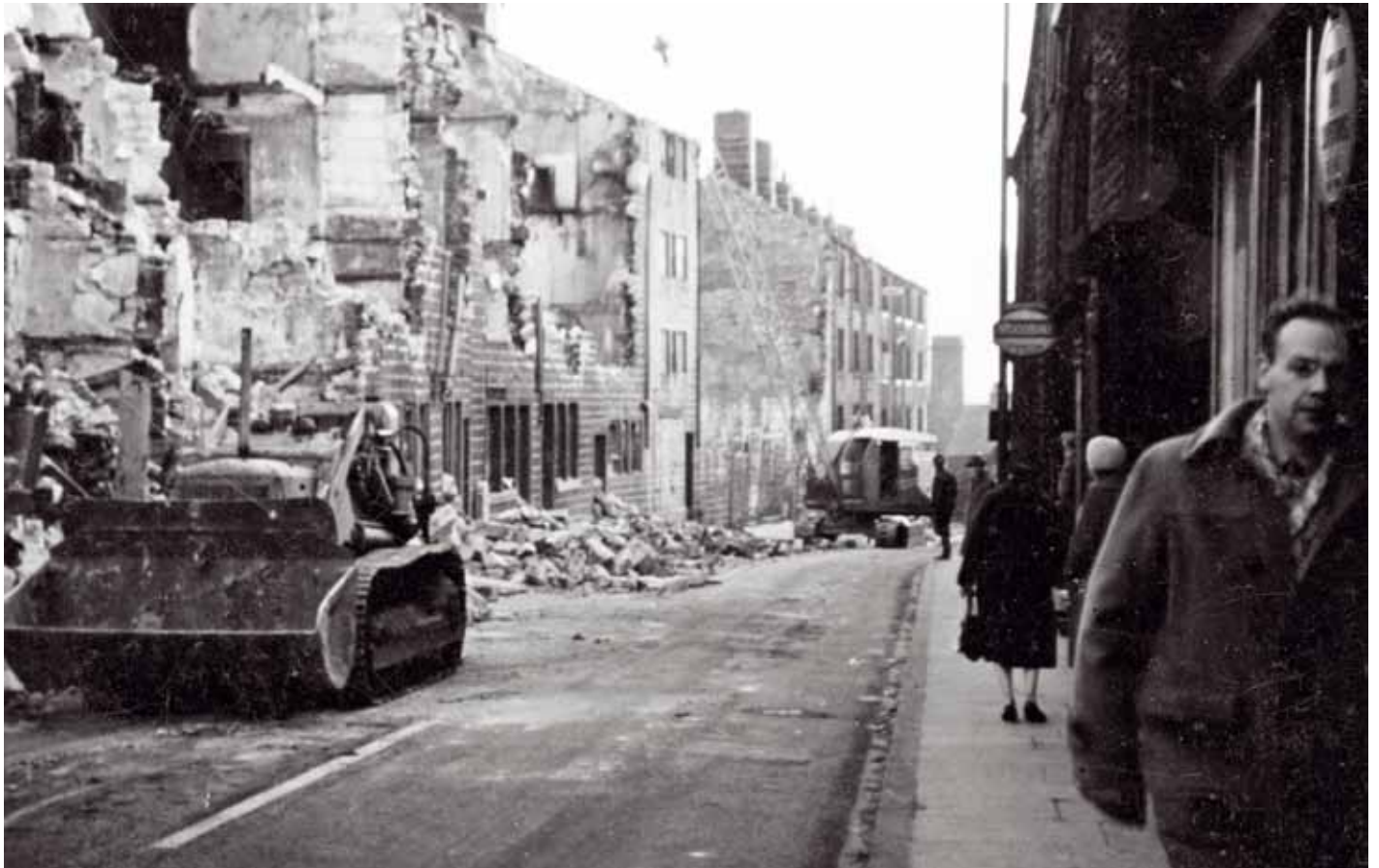
Houses on the north side of Bridge Lanes being demolished in April 1964.