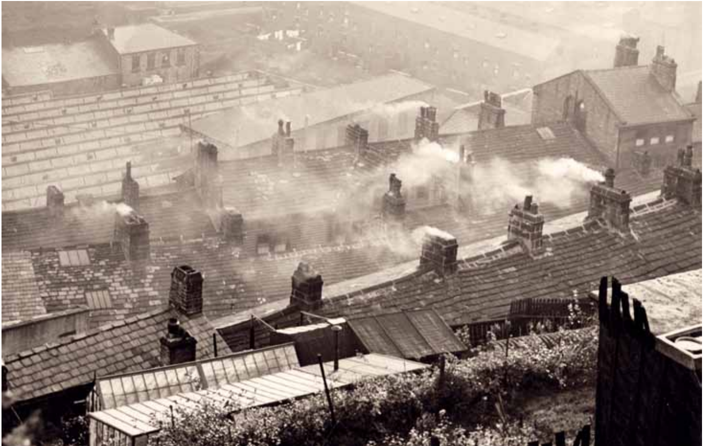
Looking over the roof tops of High Street.