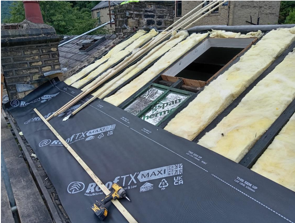
1. Roof insulation works