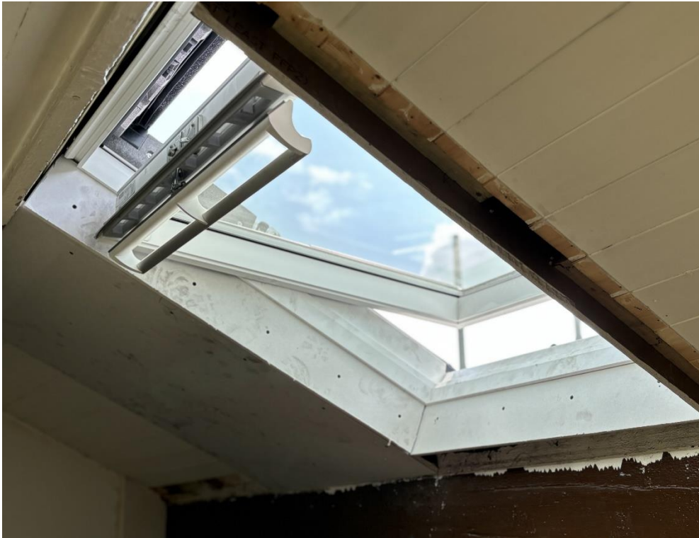
10. New Velux Window to Attic Room.