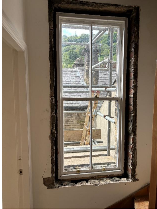
7. Window reveal strip out.