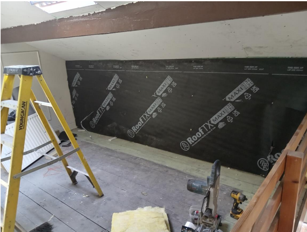
4. Breathable vapour barrier to walls