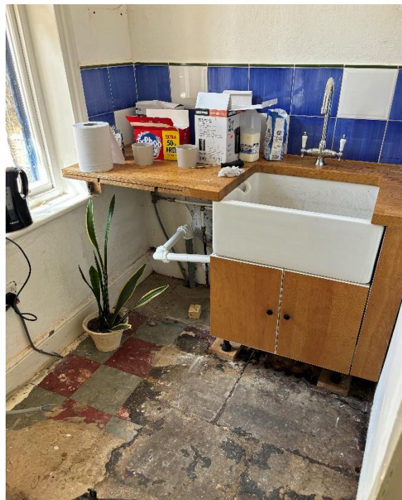
6. Kitchen strip out.