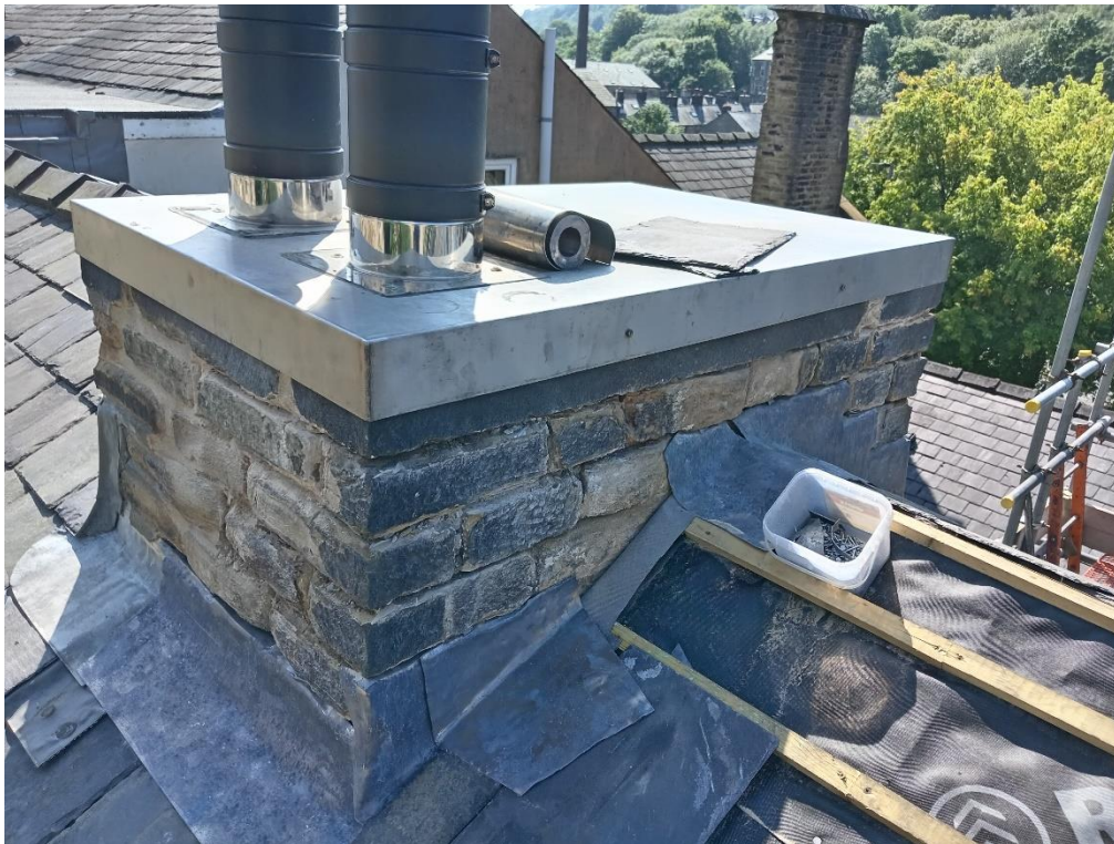
2. Works to repoint chimney stacks.