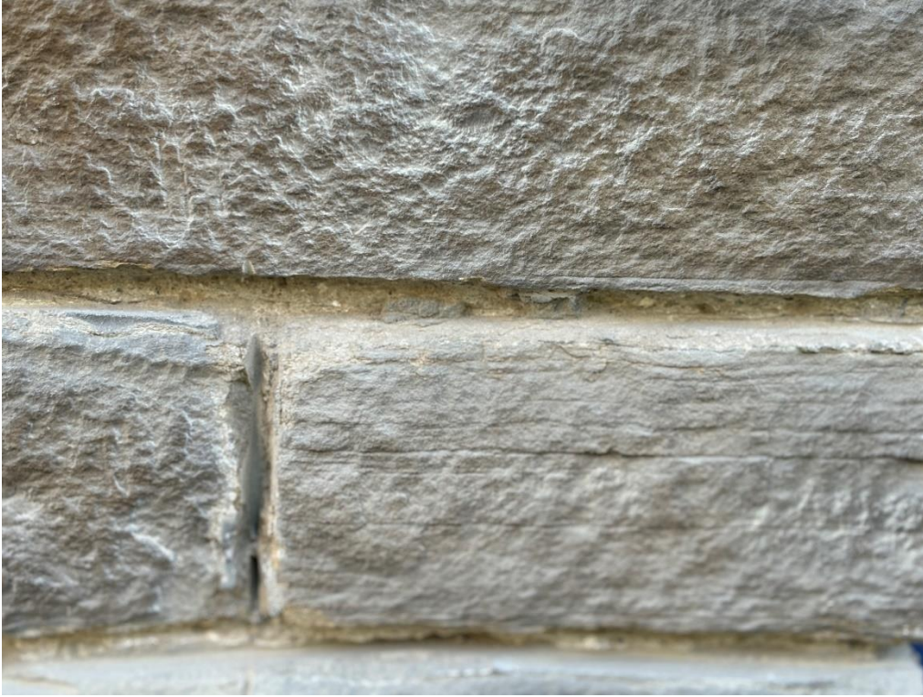
9. Mortar joints raked back.