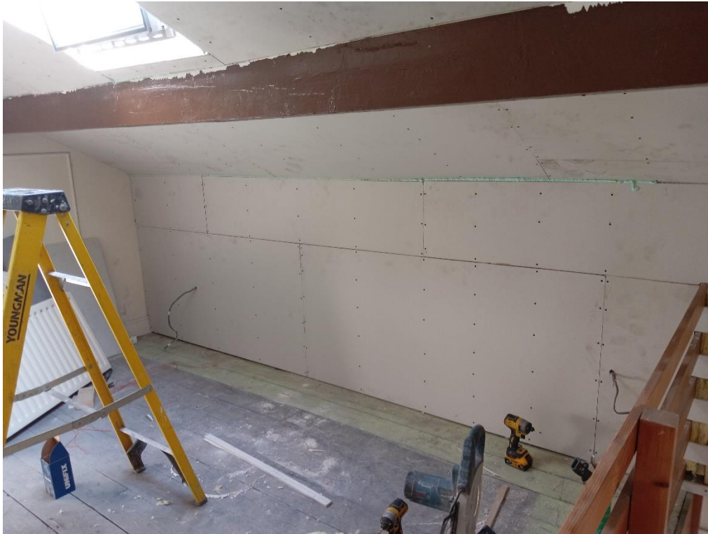
5. Re-boarding to eaves.