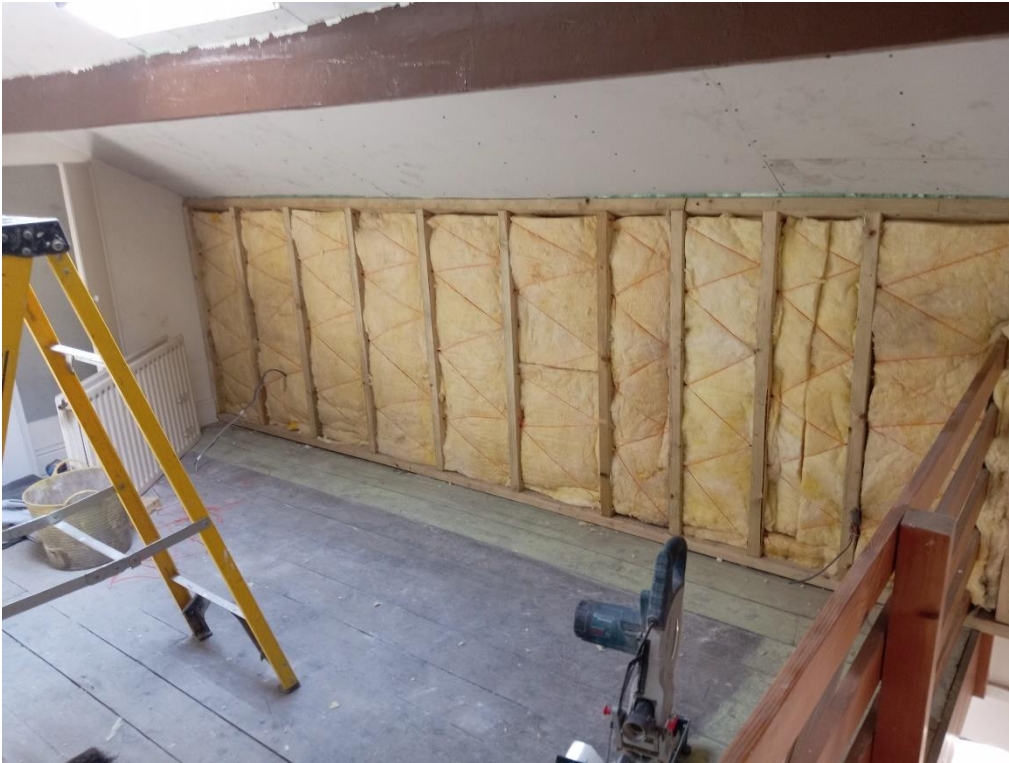
3. Improved insulation to the attic room