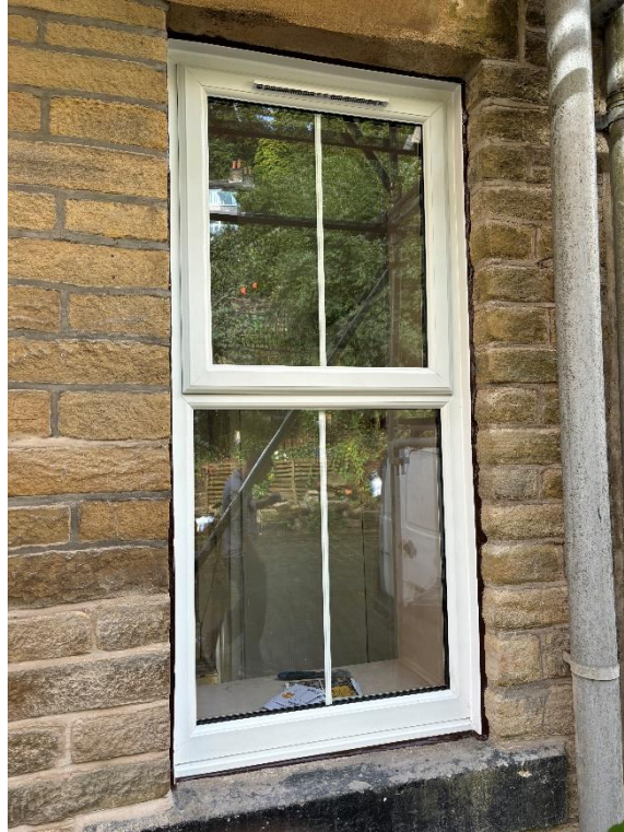
9. Window installation is complete