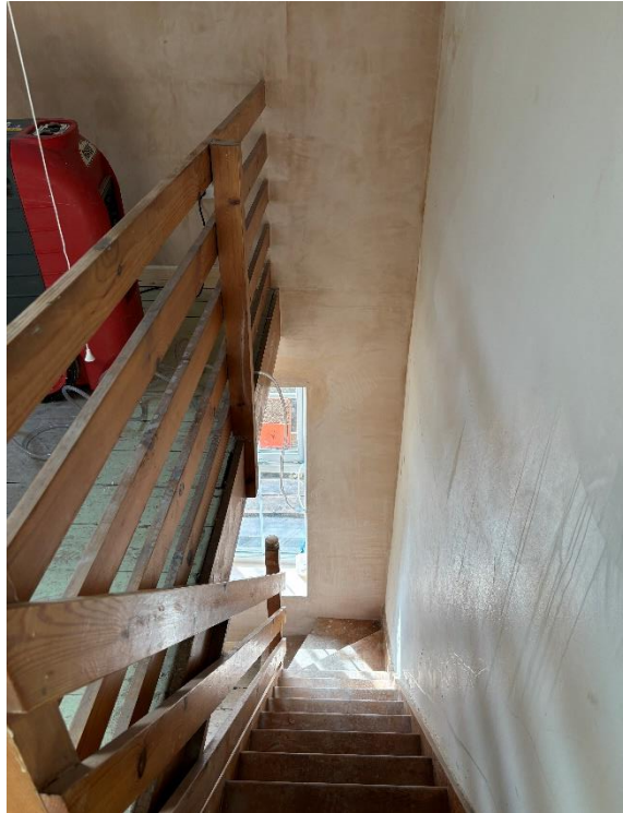
5. Dehumidifier assisting drying out