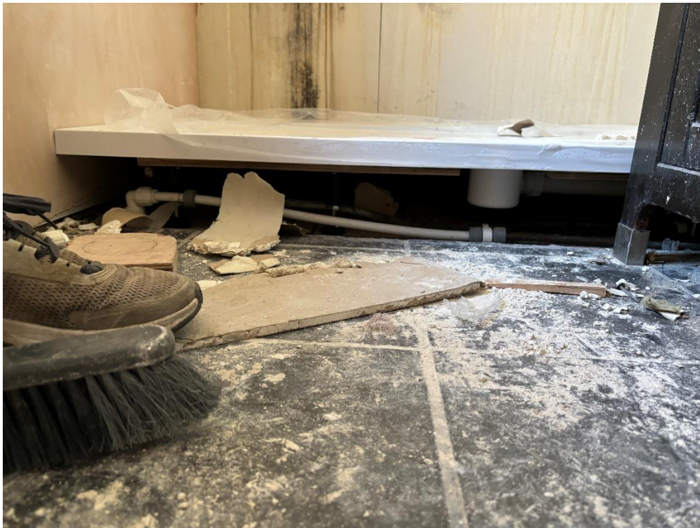
8. Shower tray arrangements