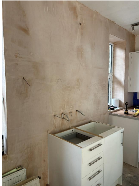
3. Plastering is complete