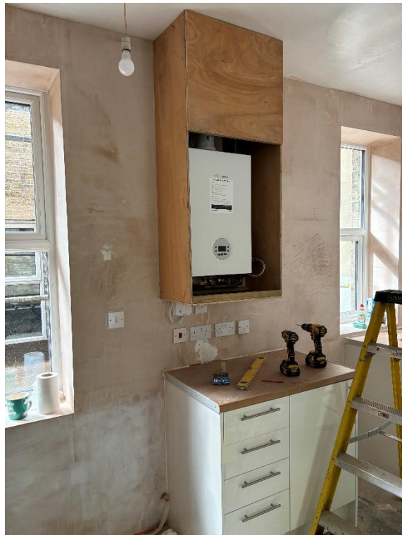
4. New boiler installation