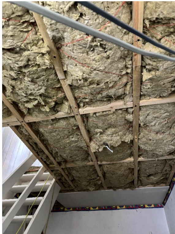
2. Basement ceiling insulation