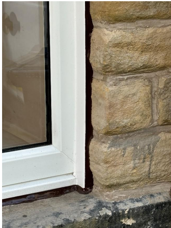
10. Eternal mastic detail to windows