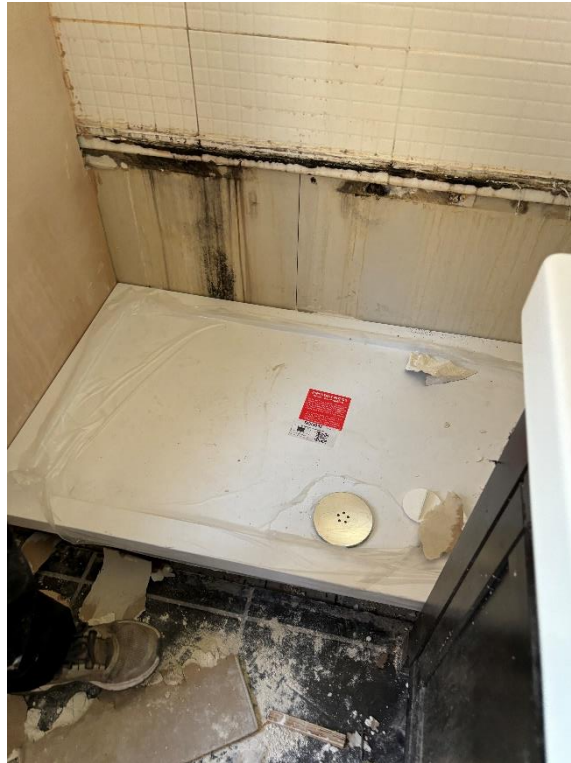
7. First fix plumbing is complete