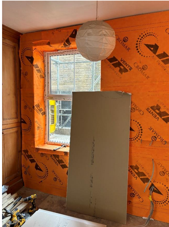
1. IWI installation