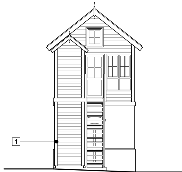
Proposed South East Elevation