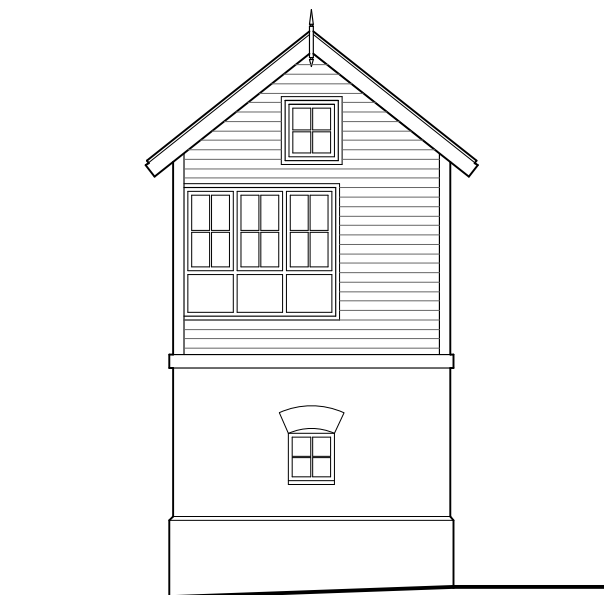
Proposed North West Elevation